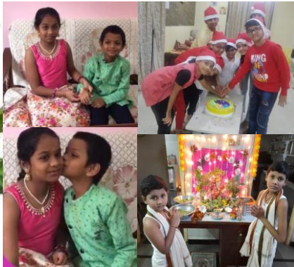
The greatness of a culture lies in its festivals