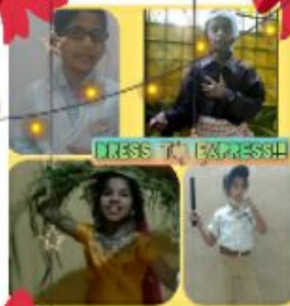
DRESS TO EXPRESS!!