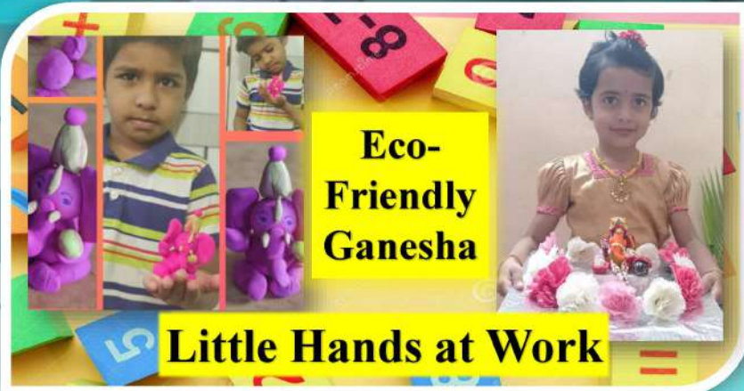
Little Hands at Work