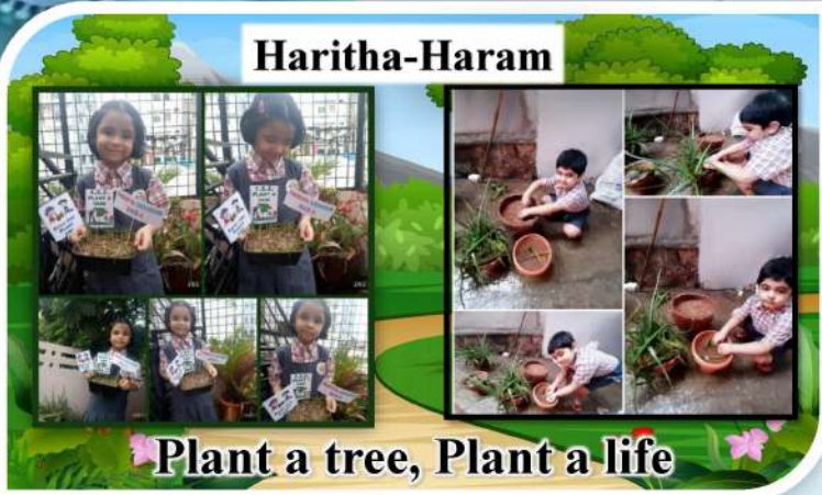
Plant a tree, Plant a life