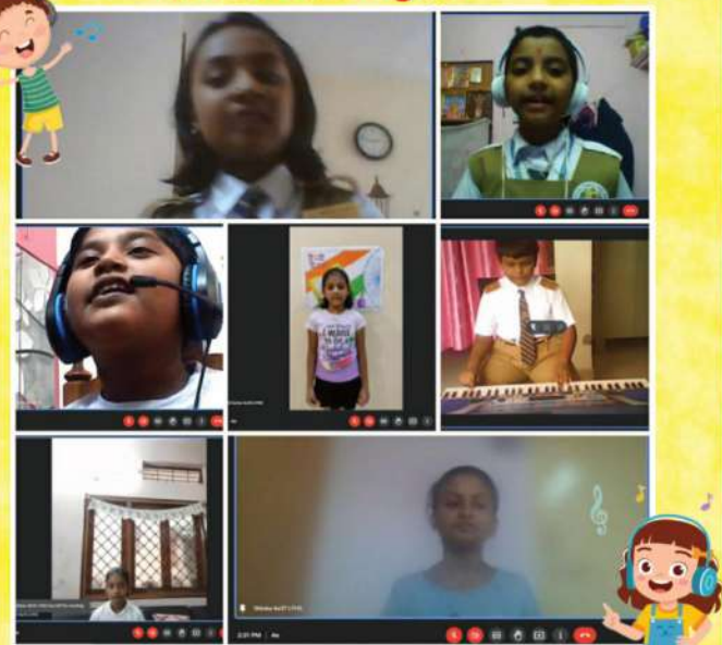
Let The Music Speak