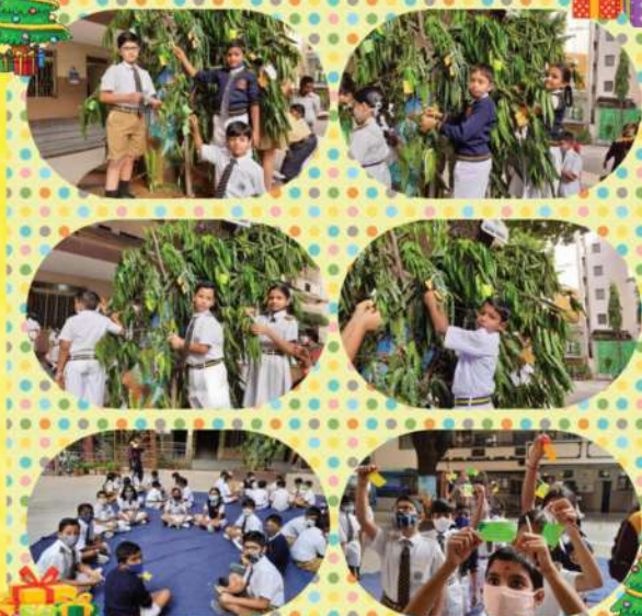
Gift Of Happiness