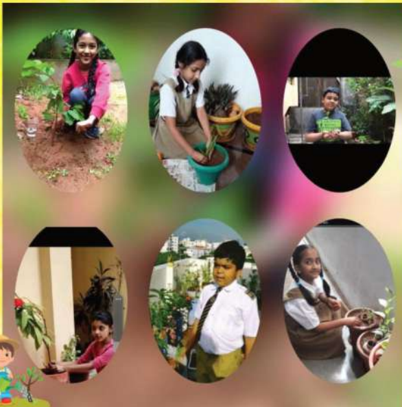
Friends Of Nature