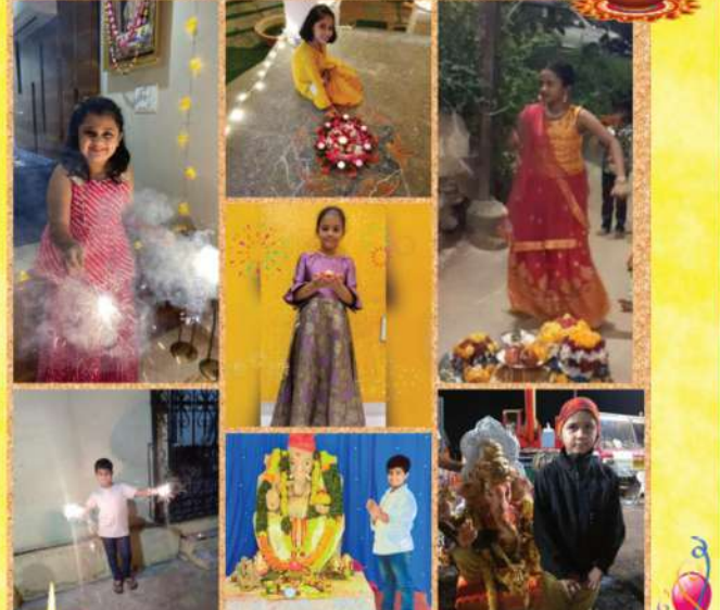
Festives And Fun