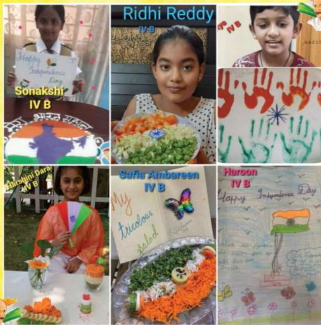
Celebrate The Freedom