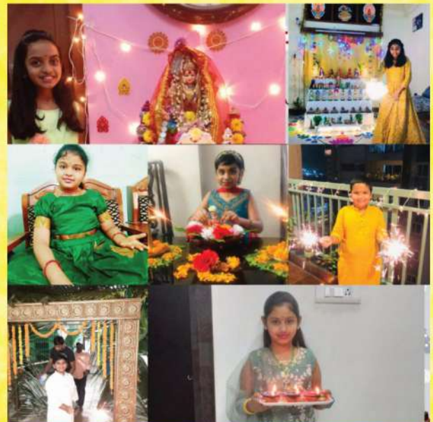
A Spark Of Kindness Can Start A Fire Of Love.