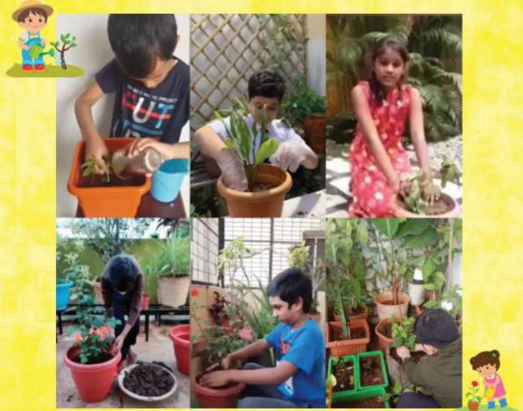
Each One , Plant One