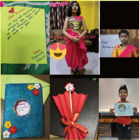
A Great Teacher Teaches From The Heart