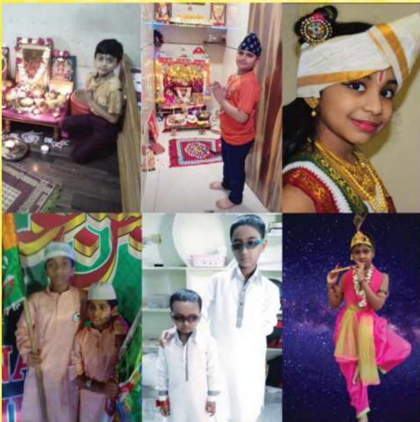
The Greatness Of Culture Can Be Found In Its Festivals