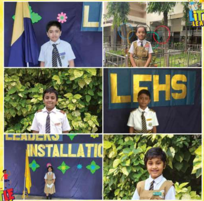
I Will Lead, Come Take my Hand