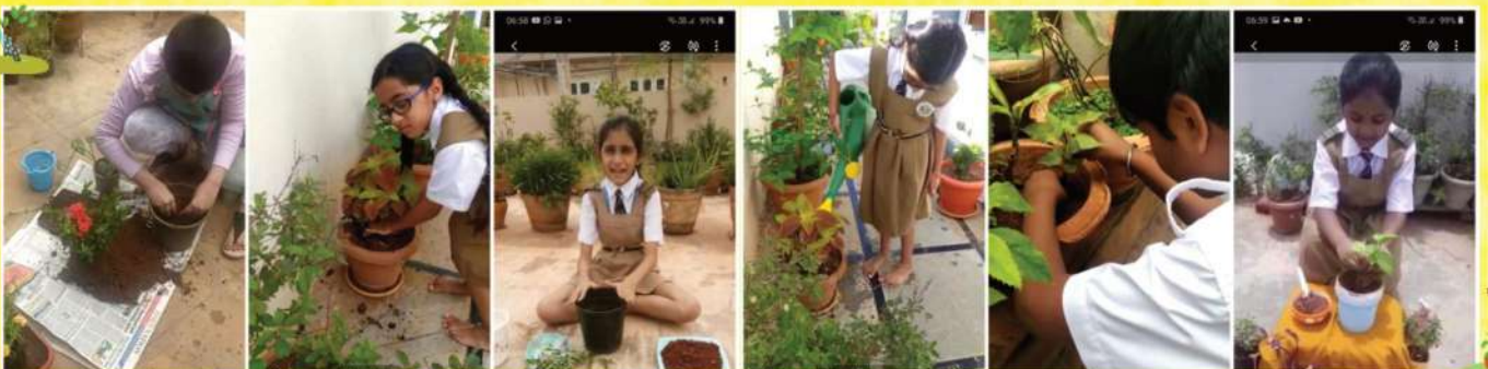
Clean And Green , Is Our Perfect Dream