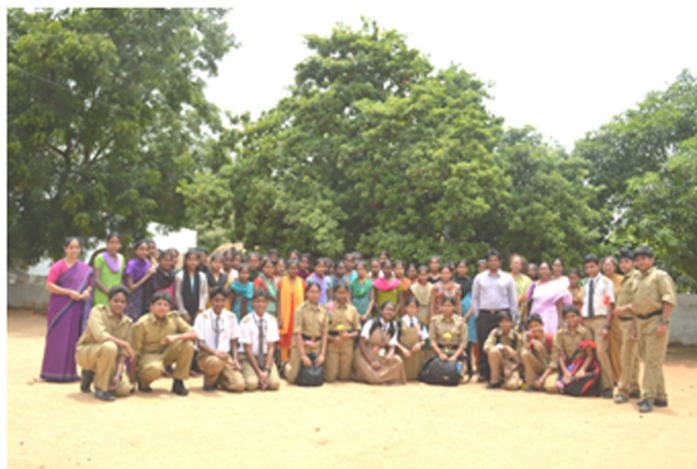
Making a difference