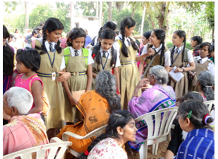
Lending a ear at Sheha Nilayam