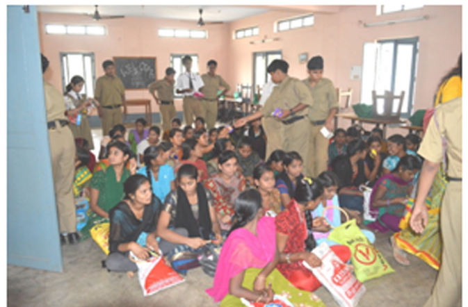
Students exhibiting their talents