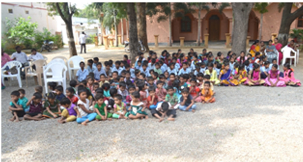
Small acts of Kindness!!