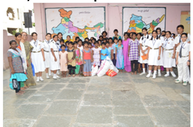
There is always goodness in giving