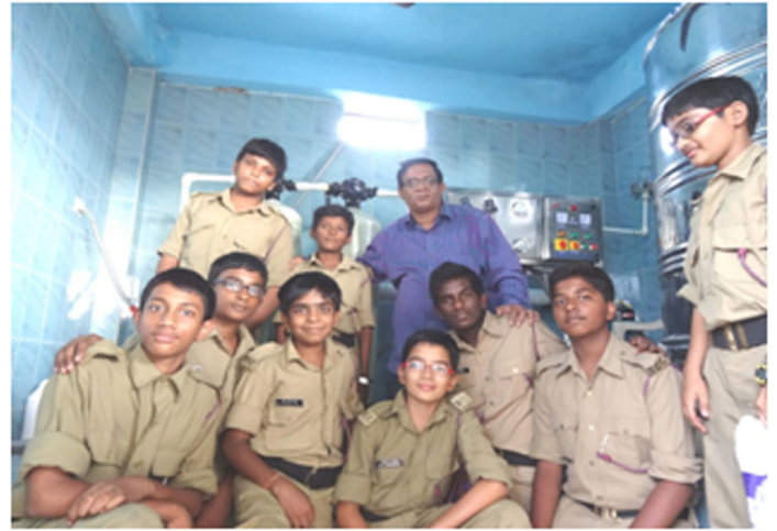
N.C.C. Cadets on a Rendezvous Installation of R.O. System