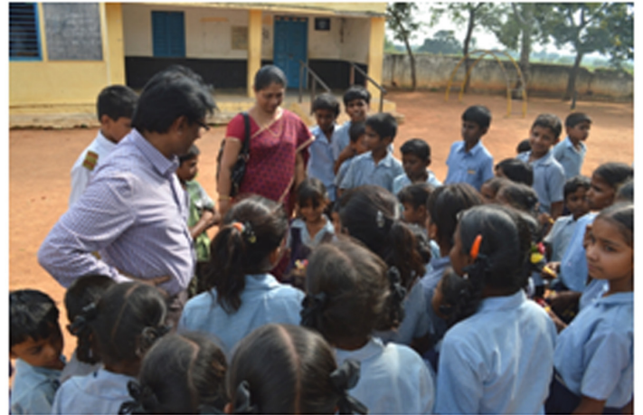
It's when you give yourself that you truly give