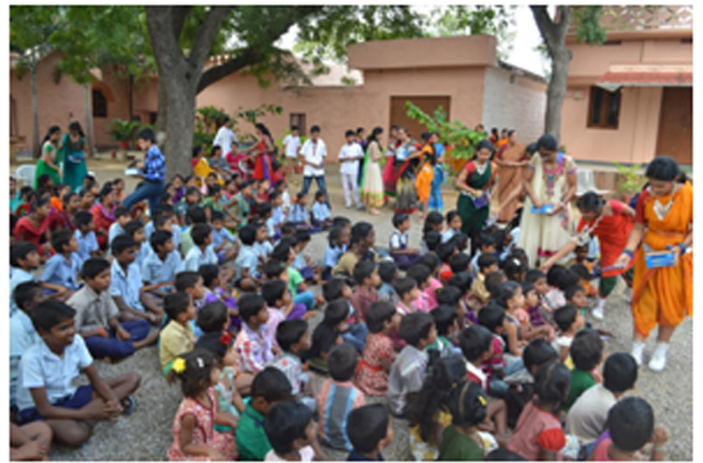
Small acts of Kindness, makes a big difference