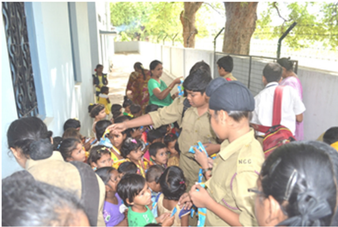
Sharing is Caring