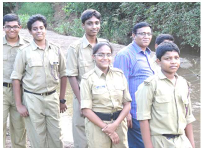
Inauguration of the R.O. System - N.C.C. Cadets