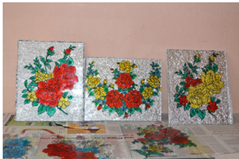
A Display of Talents