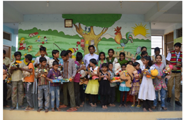
Dance, an entertainment programme - by Asha Jyothi inmates