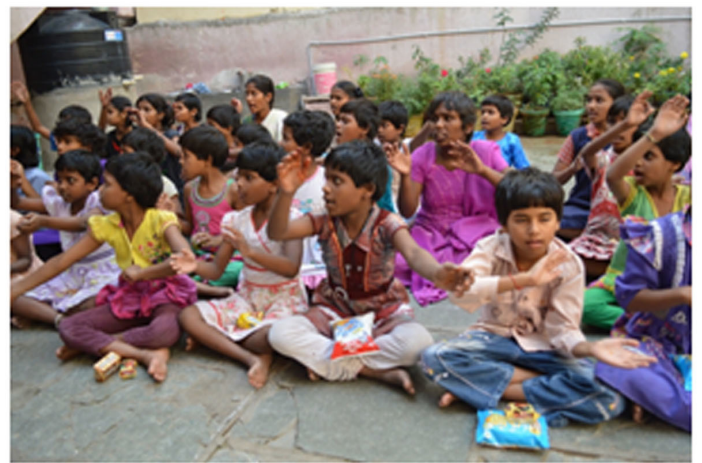
Tiny Tots welcome LFHS students