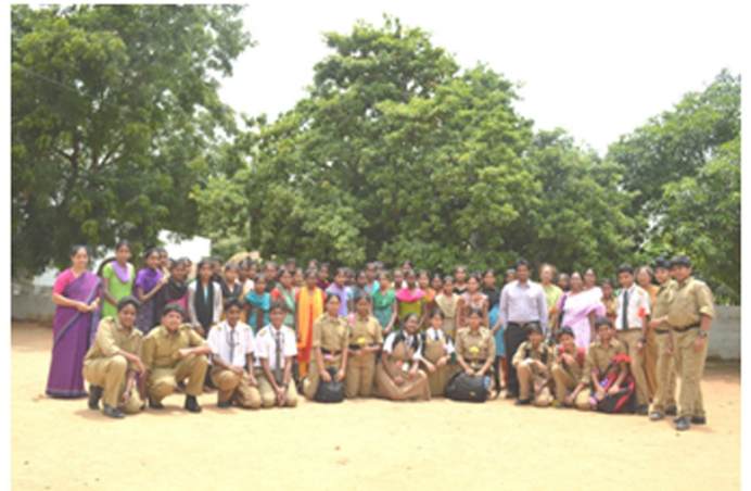
A memorable visit to Lillipur