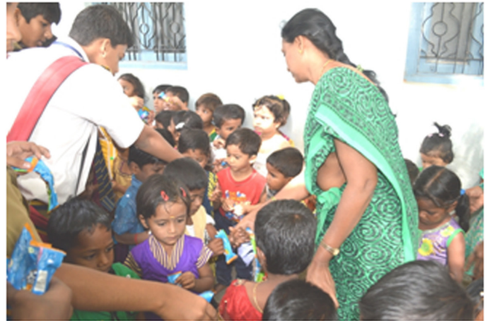
Tiny Tots receiving Christmas gifts