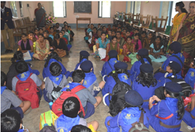
A generous act by the school cabinet members