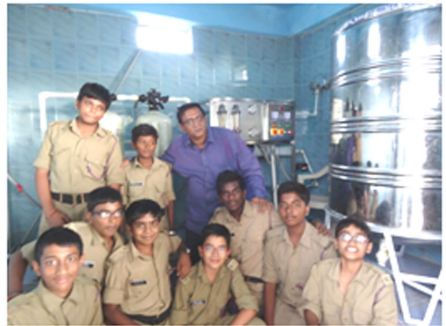
At Manchanapally Village