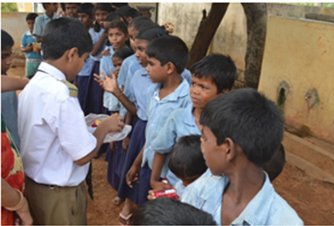
Everyone can help someone