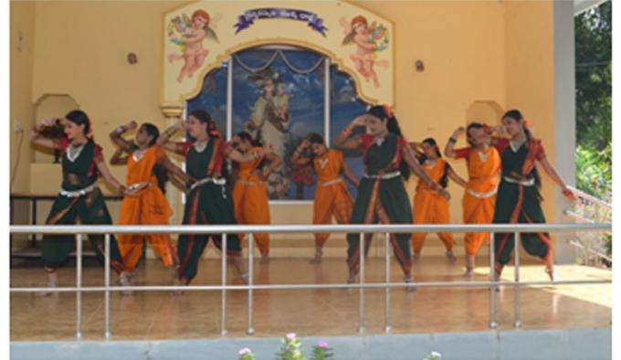
Children's Day Programme at Dubbacherla