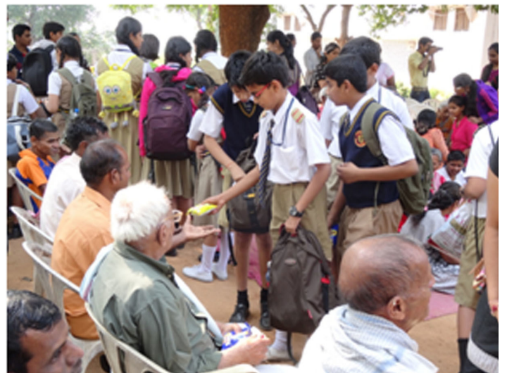
Joy increses as you give it