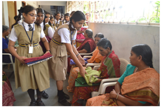
Extending a Helping Hand