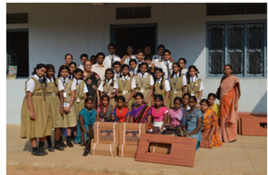
Ten girls are beneficiary of the donation of sewing machines