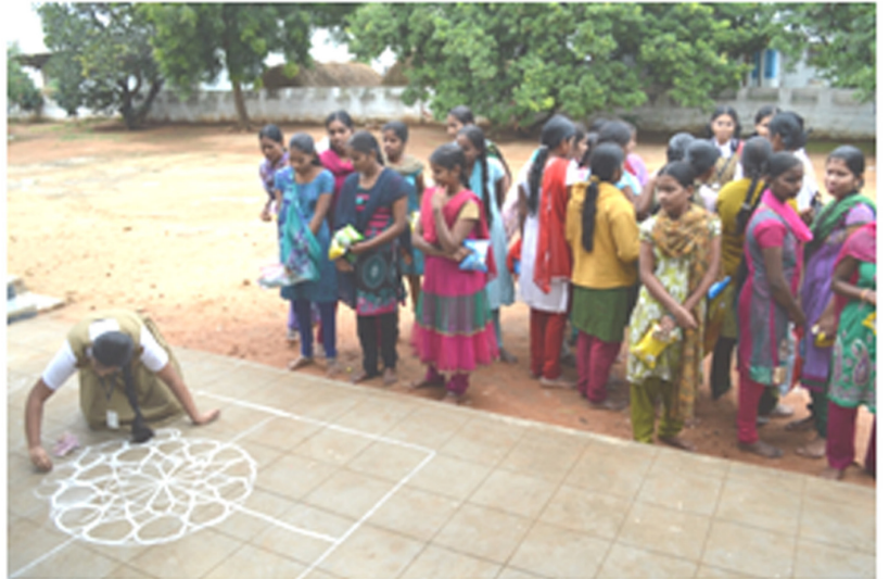
Displaying creative skills