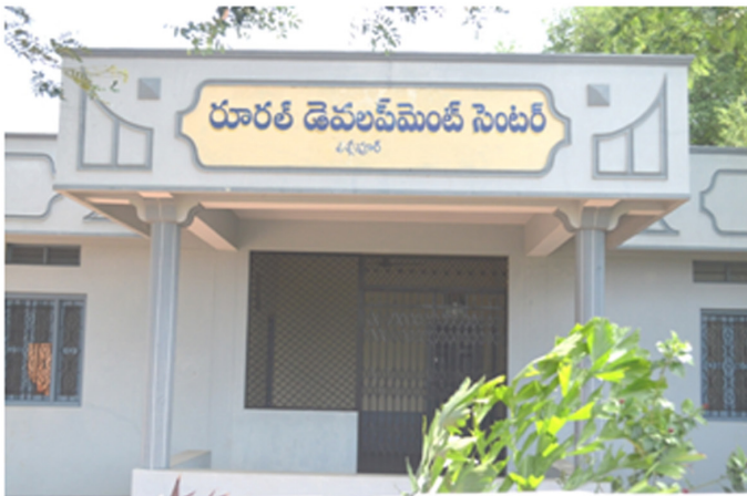
A Home Away for Home