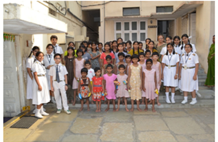
Deeds of giving, laying foundation for a bright future