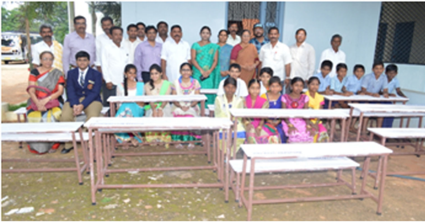
Donation of benches