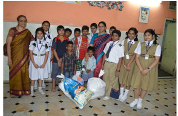
Togetherness is Happiness