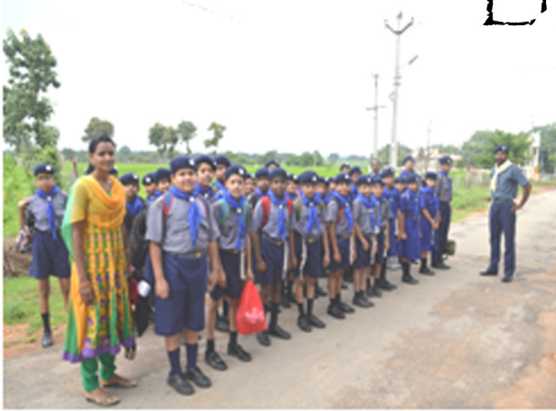
Guids and scouts reaching out to the poor