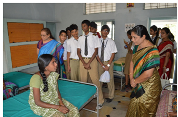
A word of Hope