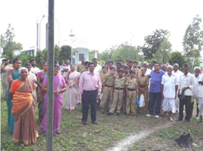
Cadets Day out