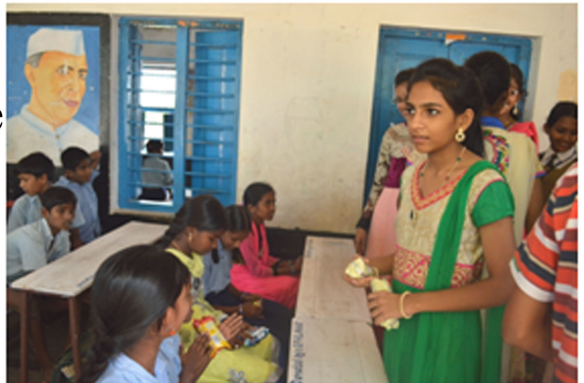
Students using the benches donated