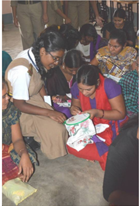
Learning to share and love