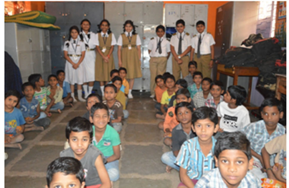
Sharing their feelings with the students