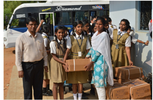
Donating Sewing Machines to the girls at Lillipur