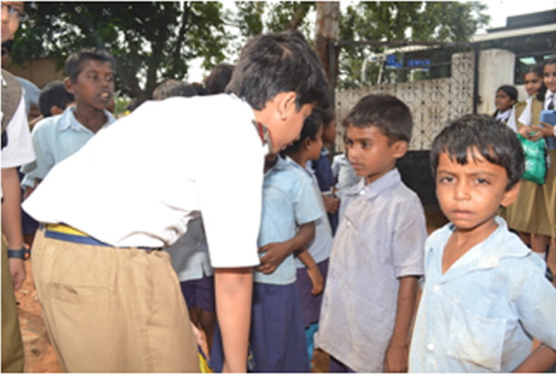
An empathetic listener