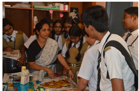
Learning to be more caring