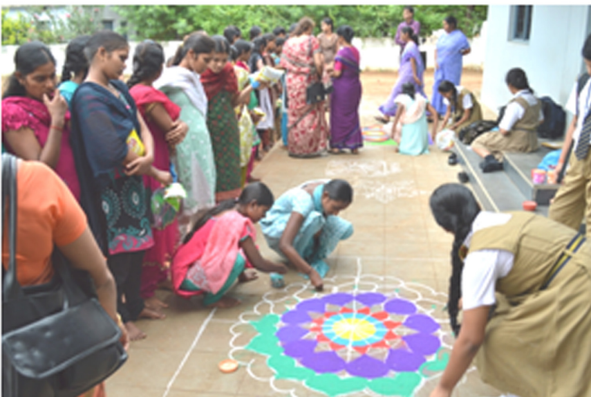
A riot of colours