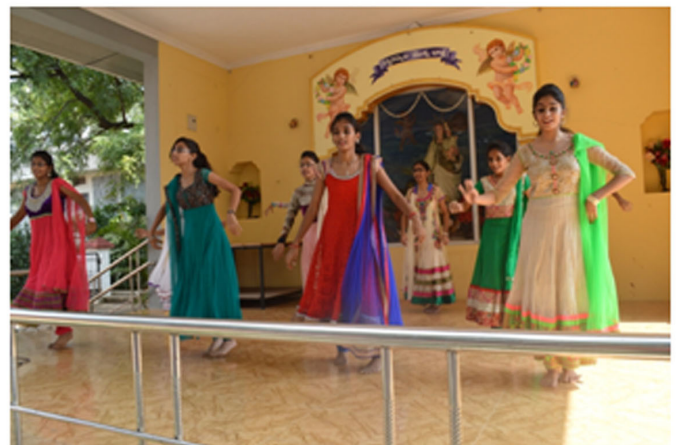
Telugu Play-"Haddulie" Entertaining the students