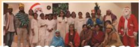
Christmas Celebrations - Joy to the World

Teachers had the dual celebration of Christmas and staff picnic at The Pragati Resorts. The day was filled with lots of fun, joy and happiness.