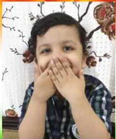
SPEAK NO EVIL