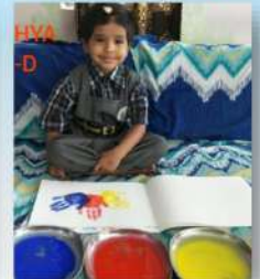
Palm Print Activity