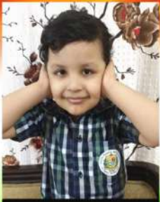
HEAR NO EVIL