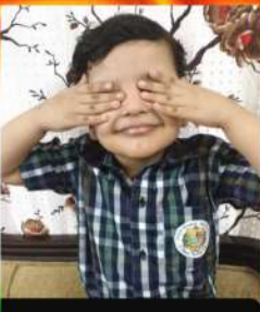
SEE NO EVIL