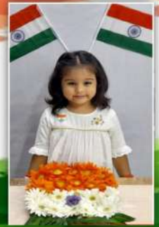
Independence Day Activity