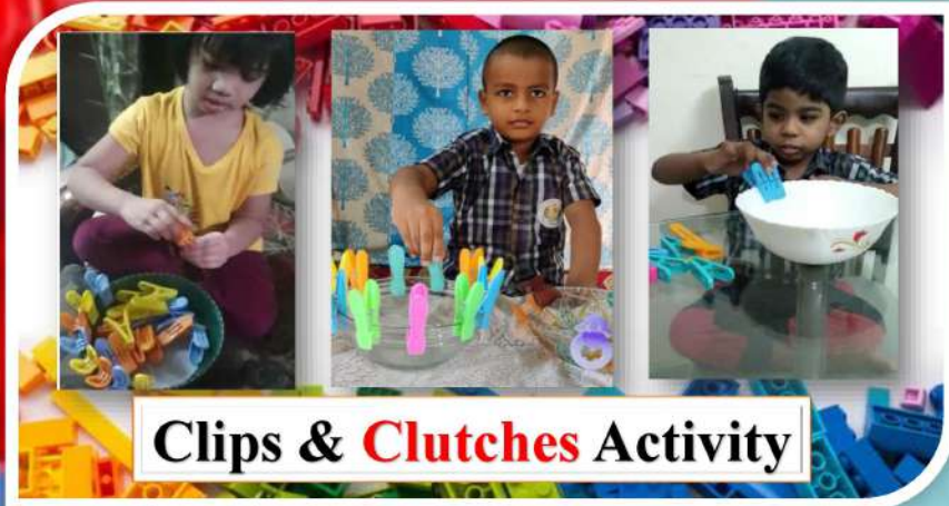
Clips & Clutches Activity