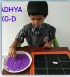
Rangoli Tracing Activity