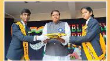
Forging the leaders of tomorrow