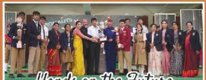
Hands on the Future