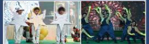
A Visual Feast