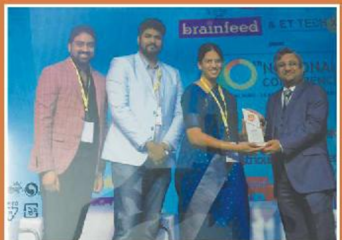
Brainfeed School Excellence Award

CED Foundation Presented The 8th Annual 5-Star Rating And Ranking School Award 2022